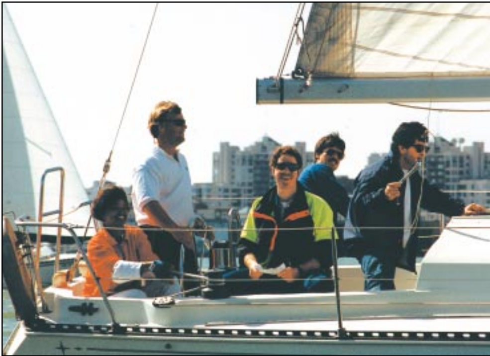
San Francisco is the Perfect Venue for Sailing Programs.