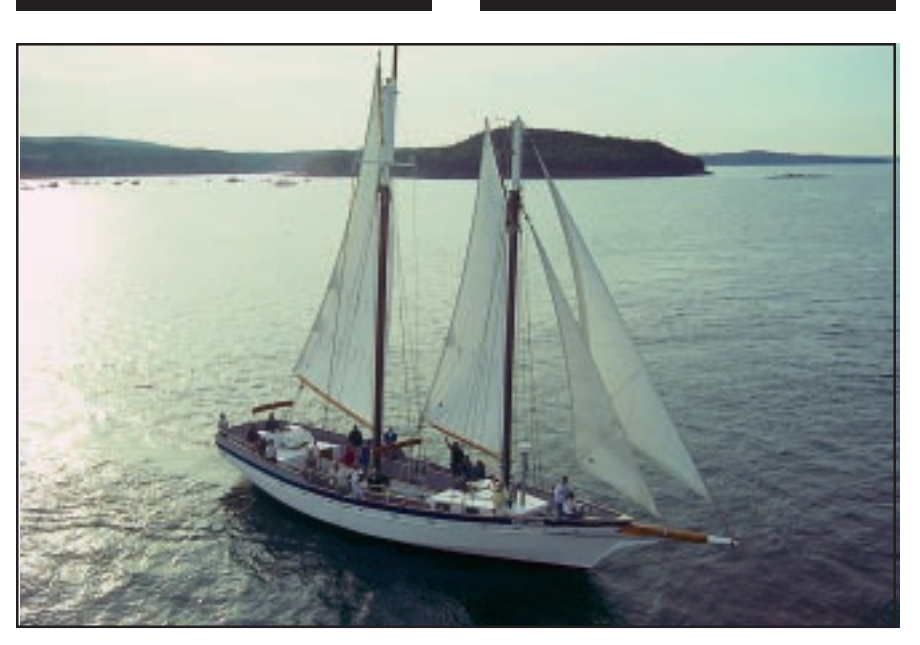
Be prepared for a great time aboard our yachts!.

If the weather is a little overcast or drizzly in the morning on the day you plan to sail with us, don't worry! The weather tends to clear up in the early afternoon for a gorgeous day of sailing!