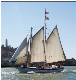
Bay Lady Under Sail

Enjoy a spectacular sunset on San Francisco Bay! Board Bay Lady for a relaxing two hour sail up the Cityfront and out into the Bay around Alcatraz. Snacks are included; A variety of Beers, Wines and Soft Drinks are additional. Private parties are available.